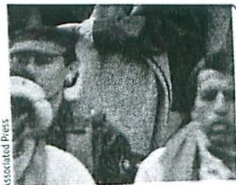
President Uribe, at a meeting in Piendamó, Colombia, last month.

But lately Mr. Uribe's political narrative is taking some complex twists. He has refused to rule out running for a third term, which isn't allowed under Colombian