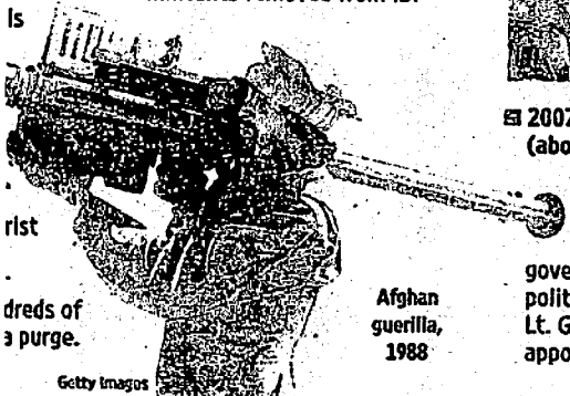
Afghan guerilla, 1988